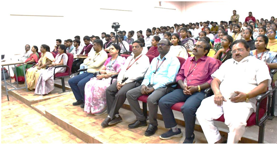
Figure: Audience at WORLD RADIO DAY Celebration

team members, and dignitaries to reflect upon the role of community radio in nation-building and grassroots empowerment.